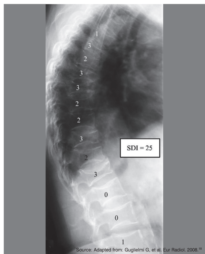
Figure 2. SDI calculation model in a spine x-ray.