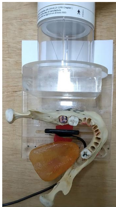
Fig. 2. An acrylic device used for image acquisition standardization and soft tissue simulation, and the positioning of the digital receptor, with a coupled lead foil, between the mandible and tongue-shaped acrylic device. The digital receptor was positioned with the transversal long axis parallel to the tooth long axis.

distance of 40 cm. Buccal soft tissue was simulated with a 2.5 mm-thick acrylic block (Vasconcelos et al. ) (Fig. 2).