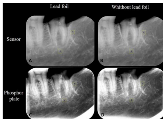
Fig. 3. Regions of interest set in inferior and lateral regions near the teeth. Images of the sensor system with (A) and without lead foil (B). Images of phosphor plate system with (C) and without lead foil (D).

(National Institutes of Health, Bethesda, MD), which allowed all evaluations to be in exactly the same position (Fig. 3). Noise value was obtained by the standard deviation (SD) of the gray's values.