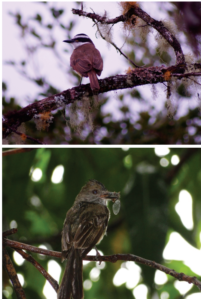
Top, the great kiskadee ( Pitangus sulphuratus ) foraging in the restinga. Bottom, Myiarchus swainsoni (Tyrannidae) perched after catching an insect in a coastal forest.