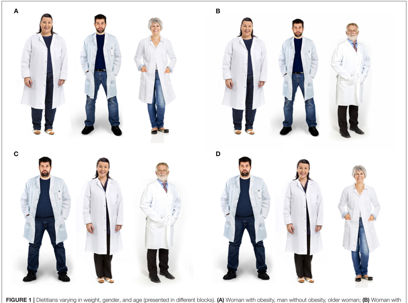
obesity, man without obesity, older man; (C) Man with obesity, woman without obesity, older man; (D) Man with obesity, woman without obesity, older woman.

Each participant evaluated one block (A, B, C, or D) of three profiles of dietitians, as shown in Figure 1 . A complete randomized block design was used. This procedure was chosen to avoid an evaluation bias by identifying the same person