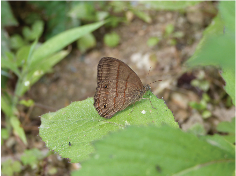
Figure 4. Magneptychia nebulosa photographed in Quebrada Honda.

(Prittwitz, 1865)) also exhibits this curved postdiscal band. Magneptychia nebulosa possesses a rather reddish discal and post discal bands. The number of white pupils in the five ventral hindwing subapical ocelli varies within M. alcinoe and is thus occasionally diagnostic; some specimens of M. alcinoe have only one pupil in one of the ocellus (K. Willmott, pers. comm.), whereas M. nebulosa always have two pupils in four ocelli, and one pupil in the larger, fifth ocellus. In addition, M. nebulosa may be confused with a variation of M. modesta (Butler, 1867), which is a species that seems to be very variable and is perhaps a complex of several species. However, M. nebulosa differs from this taxon by the combination of the undulating ventral hindwing postdiscal band and double-pupilled ocelli in ventral hindwing cell M1-M2 (usually one in M. modesta ).