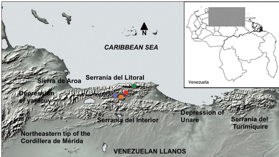
Figure 3. Map showing known localities for M. nebulosa : blue dot = Quebrada Honda, El Jarillo; orange dot = Cerro Azul, Los Teques; red dot = Altos Pipe; green dot = Massif du Naiguata.

tion here has trees with a canopy over 15 m high, such as Miconia sp. (Melastomataceae), Palicourea sp. (Rubiaceae), Clusia sp. (Clusiaceae), and Chusquea sp. (Poaceae) (pers. obs.). Several true cloud forest inhabitants (e.g. Evenus coronata (Hewitson, 1865) (Lycaenidae), Corades enyo enyo (Hewitson, 1849) (Nymphalidae) and Epiphile epicaste epicaste (Hewitson, 1857) (Nymphalidae) are also recorded here (pers. obs.). Thus, it is reasonable to expect that M. nebulosa can also be found in lower cloud forests on the slopes of the Cordillera de la Costa.