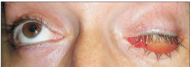
Fig. 2. Chemosis of the left orbit observed in supraversion accompanied by ptosis of the upper left eyelid.

Sergio Olate et al: Chemosis as complication in transconjunctival approach for orbital trauma. J Korean Assoc Oral Maxillofac Surg 2017