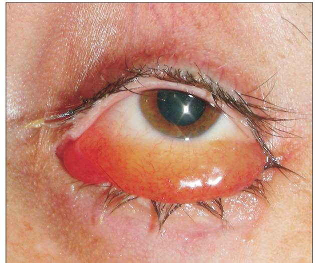
Fig. 3. During forced movement of the upper eyelid, an extensive chemosis subsequent to the transconjunctival approach is observed in the left orbit.

At the first out-patient check-up 10 days after the surgery, the patient presented with severe chemosis of the left eye with 5 mm of exposure (Fig. 3), slight ophthalmoplegia and ptosis of the upper eyelid, with no signs of pain or visual alterations. Ciprofloxacin ophthalmic solution with corticosteroids (drops, 2.5 mL per day; S.M.B. Farma, Santiago, Chile)