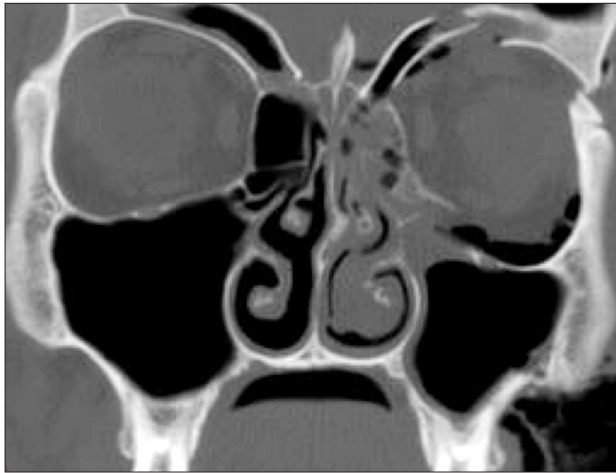
Fig. 1. Preoperative computed tomography showing an orbital fracture with compromised orbital rim and floor.

Sergio Olate et al: Chemosis as complication in transconjunctival approach for orbital trauma. J Korean Assoc Oral Maxillofac Surg 2017