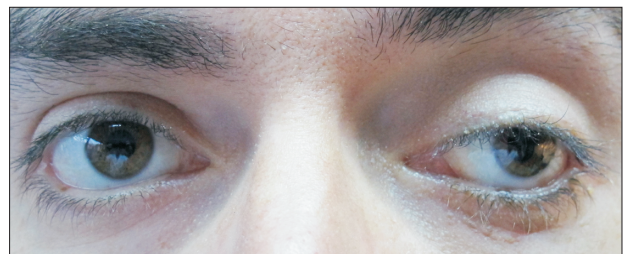
Fig. 4. Condition after 1 month where total recovery from the chemosis can be seen.

Sergio Olate et al: Chemosis as complication in transconjunctival approach for orbital trauma. J Korean Assoc Oral Maxillofac Surg 2017