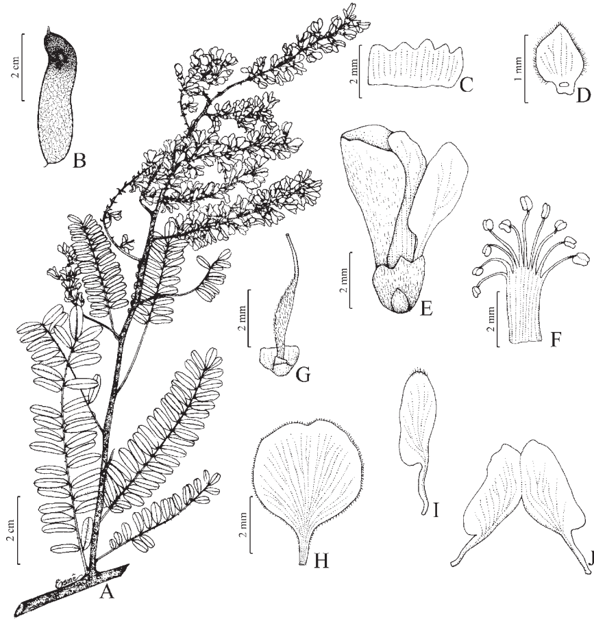
Figure 2. Machaerium jobimianum C. V. Mendonça & A. M. G. Azevedo. —A. Branches and inflorescences. —B. Fruit. —C. Calyx. —D. Bracteole. —E. Flower. —F. Androecium. —G. Gynoeceum. —H. Standard petal. —I. Wing petal. —J. Keel petals. A, C–J drawn from the paratype L. A. M. Silva et al. 189 (CEPEC); B drawn from the paratype C. V. Mendonça & D. A. Folli 599 (UEC).

stipules. It is closely similar to M. floridum (Mart. ex Benth.) Ducke, but differs by its lustrous adaxial leaflet surface, its leaves with more leaflets (vs. 17 to 25 in M. floridum ) that are more closely spaced than in M. floridum , its shorter ovate bracteoles and calyx (vs. 1.5–2.5 mm and 2.5–3 mm), and the glabrous marginal staminal sheath (vs. ferruginous-tomentose). The species also resembles M. myrianthum Spruce ex Benth., a vine or shrub from the Amazon Basin, which has paniculate inflorescences that are wider (up to 15 cm), a pandurate standard petal, and a longer fruit stipe (to 6–7 mm).