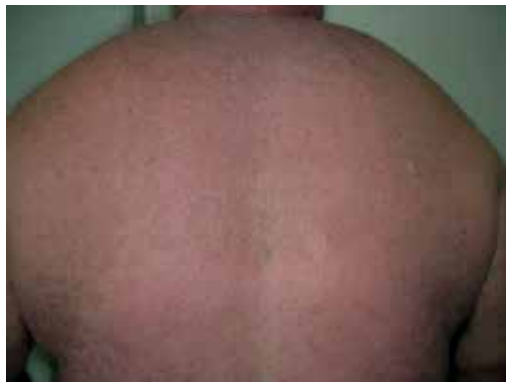
FIGURE 1: Papular eruption associated with erythema on the back and neck