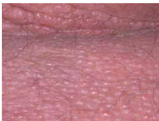
FIGURE 2: Coalescing normochromic papules, some in linear arrangement, and sclerodermiform surrounding skin