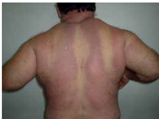
FIGURE 3: Erythematous areas interspersed with pallor and evidence of proximal weakness